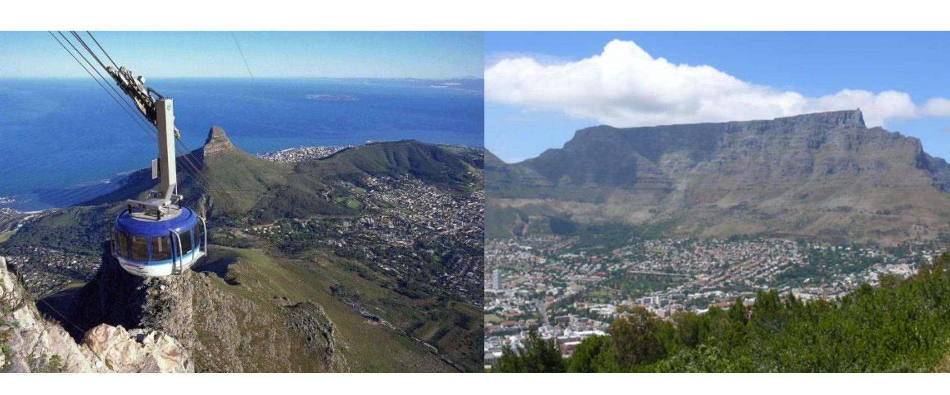
Table Mountain Cable Car